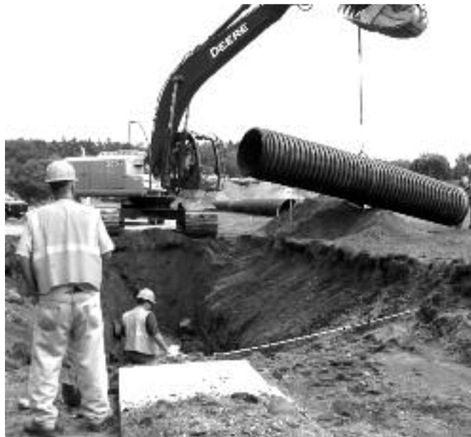
CP Smith storm drain installation

DPW is a complex department with a wide range of responsibilities and a diverse range of revenues. By sharing resources and working as a team, this department is able to live within its means and deliver essential services in a cost effective manner. We are grateful for the opportunity to serve the citizens of Burlington now and to continue to search for ways to improve our delivery of services in the future.