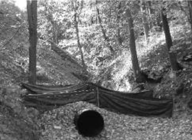
Stormwater improvement, Plattsburgh Avenue