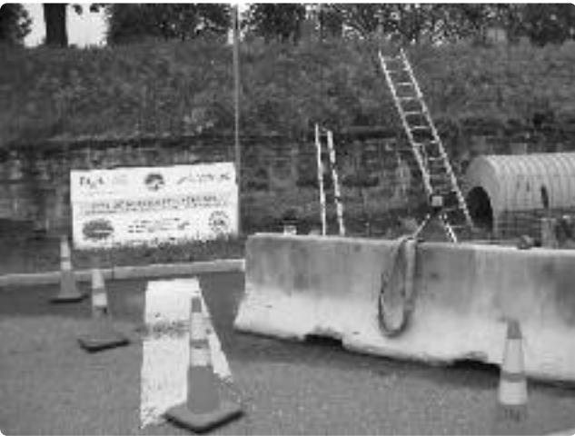
Improving drainage system at Willard and Riverside intersection