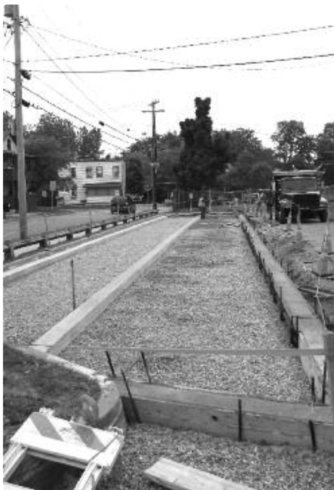
Installation of pervious concrete parking lot at Integrated Arts Academy (Wheeler)