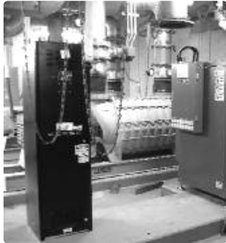
New Turbo Blower at North Wastewater Plant