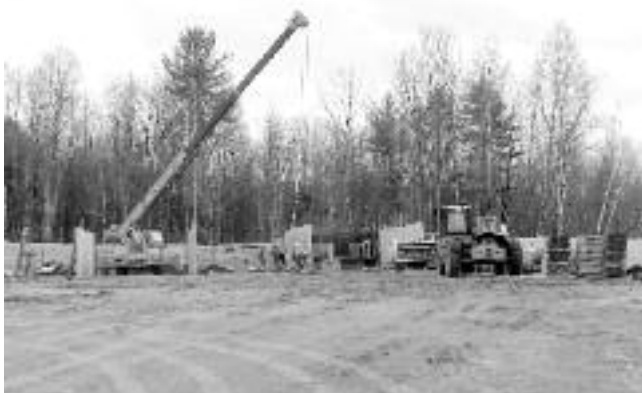
Composting bunkers under construction.

The Materials Recovery Facility in Williston is owned by CSWD and privately operated by Casella Waste Management. In FY11, 39,264.77 tons of recyclables were collected, sorted, baled, and shipped to markets. This represents an 8.6 percent decrease from the previous year. The recycling markets rebounded from the recession better than expected, with the average sale price for materials at $131.09 per ton, a 41.67 percent increase over last year.