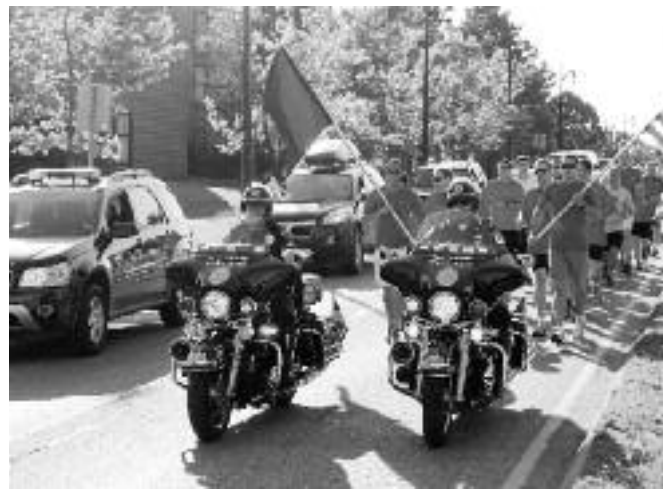
BPD Guiding the Torch Relay

In FY11 we deployed new technology that will enhance transparency and ease access to crime reporting City-wide including: