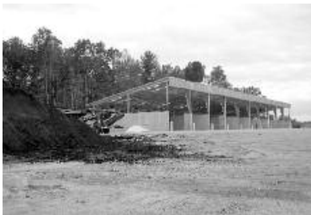
Bunkers built and ready to begin processing food scraps, yard debris, and farm manures into rich, black compost.

A variety of Educational Programs and tools are available to assist residents, institutions, and businesses to reduce and properly manage waste. The CSWD Hotline (872-8111), Website: ( www.cswd.net ), e-newsletter, school