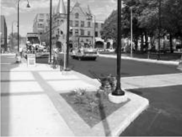
Putting finishing touches on St. Paul Street improvements