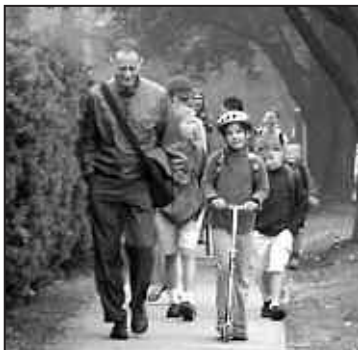
Mayor Kiss on Walk to School Day.

num housing code inspections and investigating zoning violations.