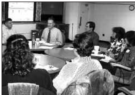
Mayor Kiss convenes one of his business round-table meetings.