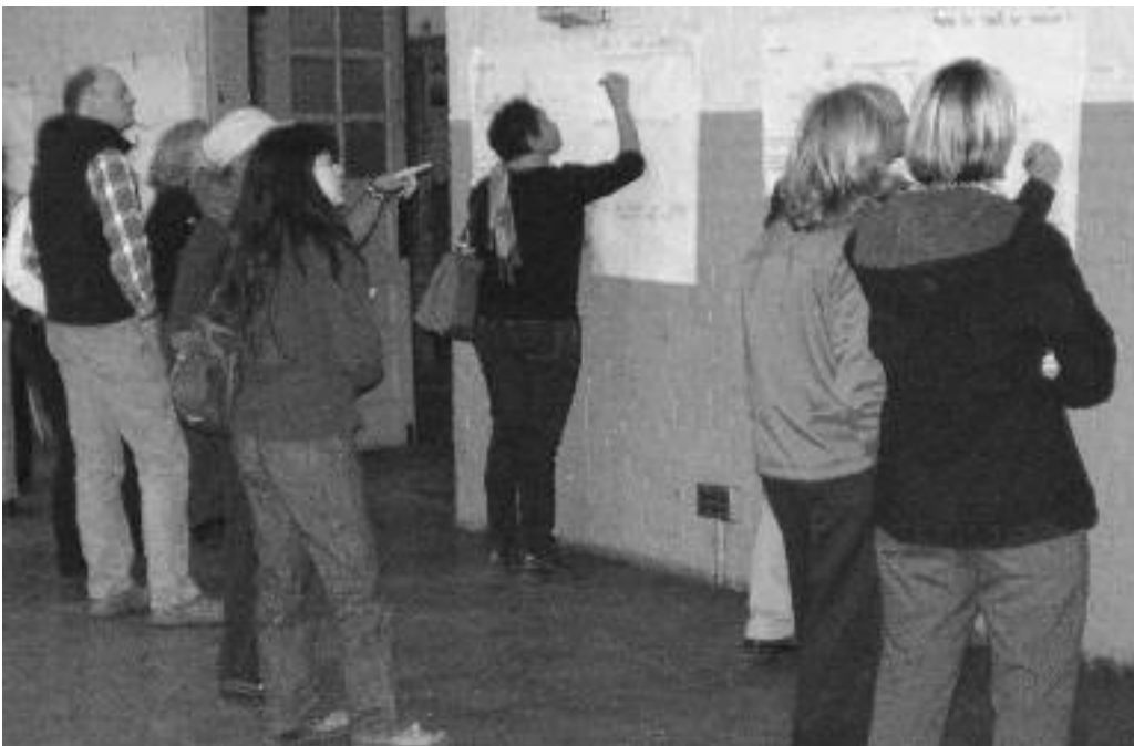
Civic engagement at Celebrate Burlington event

Burlington Schools successfully implemented new hiring practices to ensure that all new staff are culturally competent and to help further diversify faculty and staff. The District also con-