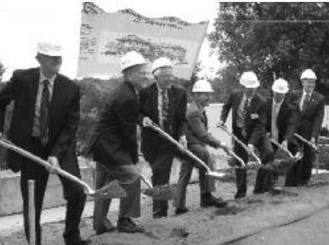
Groundbreaking for the new Community Health Center building

institutions are good partners of the City and recognize a shared future.