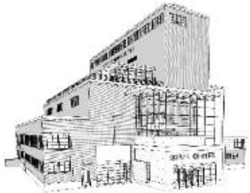
Moran Plant site rendering