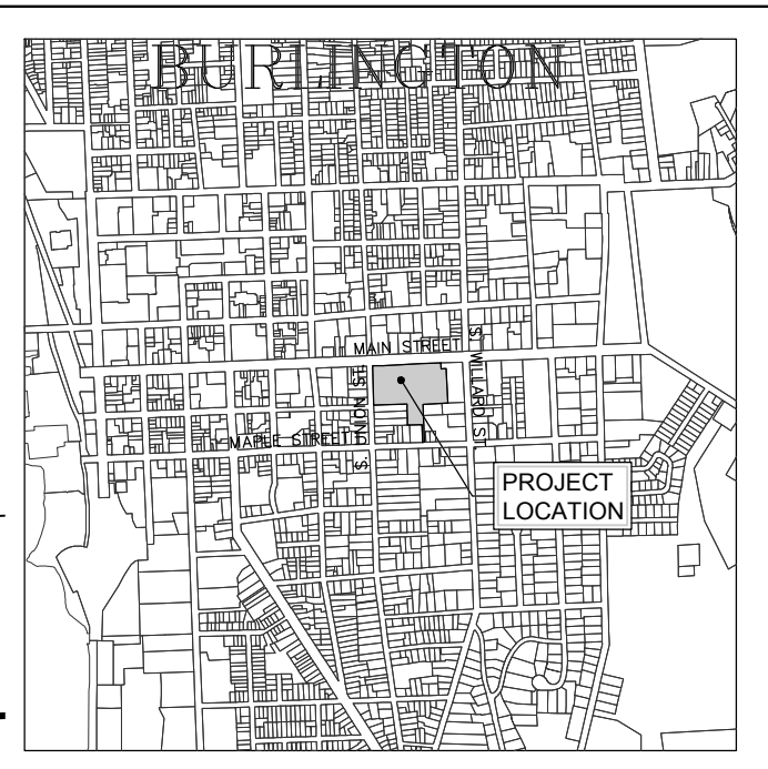
LOCATION MAP 1" = 2000'