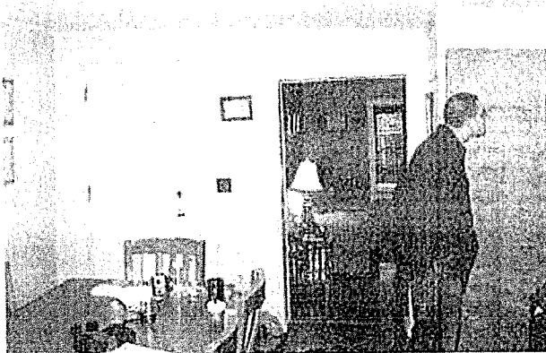
Typical interior view showing modern finishes.