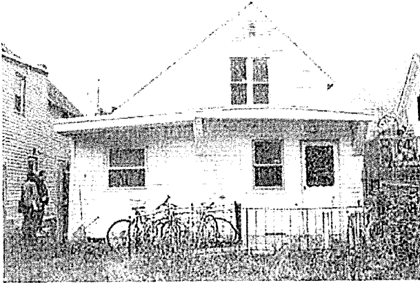
Rear elevation, showing non-historic rear addition.

Historic Preservation preliminary comments from Liz Pritchett December 7, 2009