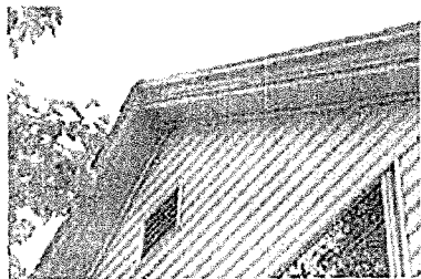
The molded cornice is one of few remaining historic elements.