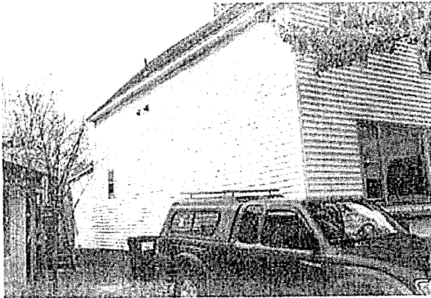
The north elevation has only 1 window, most likely others were removed or covered over.