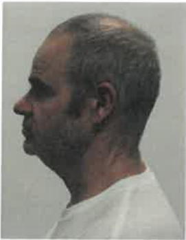
(Profile - Left)