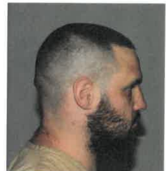
(Profile - Right)