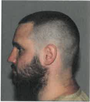
(Profile - Left)