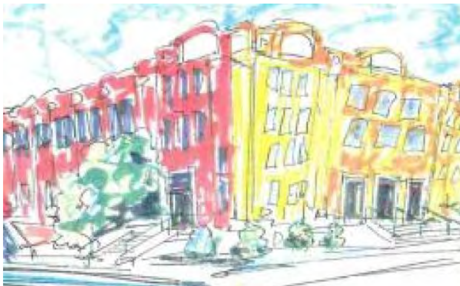
Burlington City Arts 1995

Our team has strong New England roots and many of us are well known across state boundaries for our public service and our successful projects. We have read carefully through the research, strategy and planning documents and appreciate the time and attention given to this project. Burlington cares about its growth and works to support a vision for current residents and future growth. Our goal is to offer ideas that support the growth of the area that is in alignment with the City's vision. We look forward to discussing our proposal and forging working partnerships with all those who care so deeply about this project and have a stake in its success.